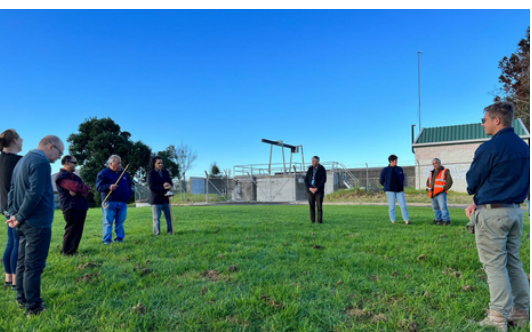
Blessing the start of a wastewater pipeline upgrade in Pāpāmoa.